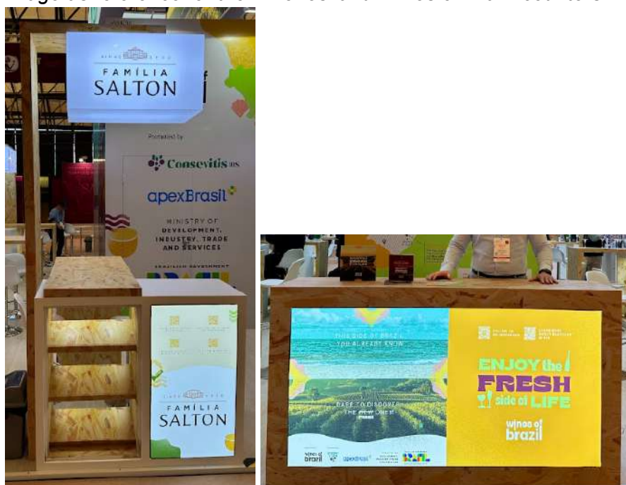
Image as reference for the wineries' and Wines of Brazil counters.